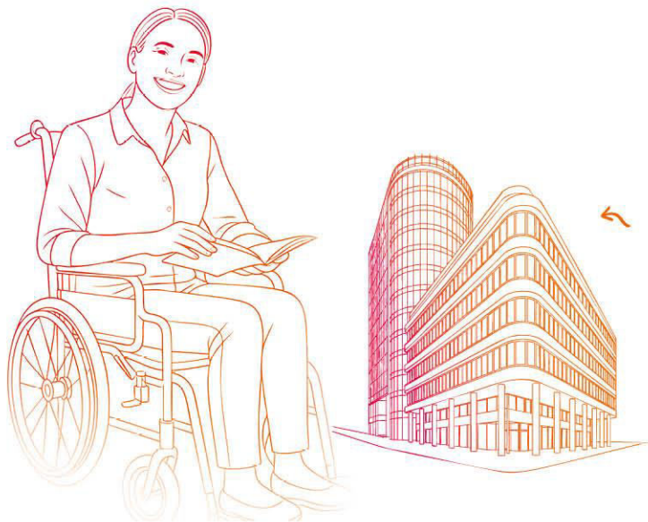
Landesbank Baden- Württemberg GERMANY

#This website has not been reviewed by the Securities and Futures Commission in Hong Kong